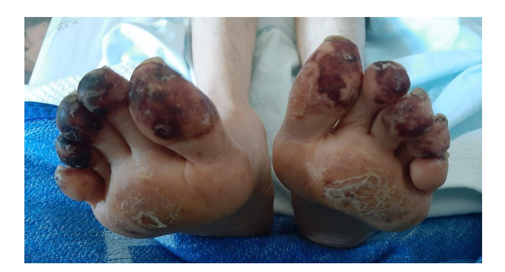
Figure 1. Plantar view of the toes of the patient – necrotic areas are seen in all toes, except the 4th, worse in the right foot (left side of the picture). Peeling of the skin is also observed.