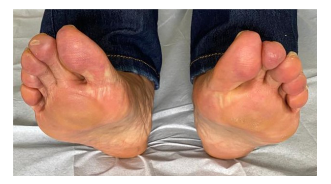
Figure 4. Plantar view of the toes of the patient six months after the pictures presented in Figure 1 – note the total resolution of the necrosis, with residual telangiectasias observed.

Due to the GI symptoms, a contrast-enhanced abdominal CT scan was performed and revealed wall thickening involving the colon and the rectosigmoid junction, with slightly increased attenuation of mesenteric fat (Figure 2). Small bowel segments were spared in the images. Colonoscopy showed ulcerate areas mainly located in the sigmoid and rectum; local biopsies presented a necrotizing inflammatory process with large ulceration and fibrinous-granulocyte exudate (Figure 3) and the immunochemistry was negative for both cytomegalovirus and herpes simplex infection.